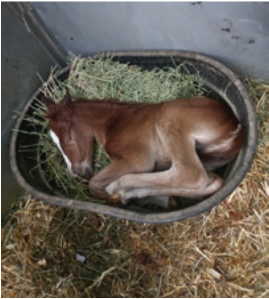
Look at how cozy he is! Little Tito can rest comfortably knowing he has a friend like you who helps look after him.

When SPCA Humane Officers rescued a horse named Tilly, she was emaciated and had a five-month-old foal by her side. But we didn't know that the long-neglected mare was also pregnant.