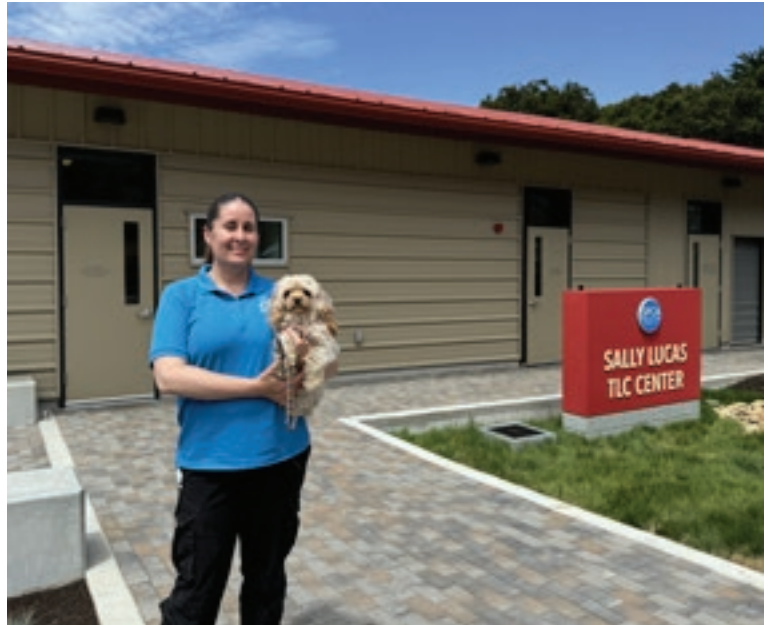
With your support of TLC, we truly change lives!

Inspired by the success of our lifesaving program, the growing need to help more dogs and your incredible generosity, we created a new space where we train, socialize, build confidence and make life fun for the most vulnerable dogs in our care. With your support of TLC, we truly change lives!