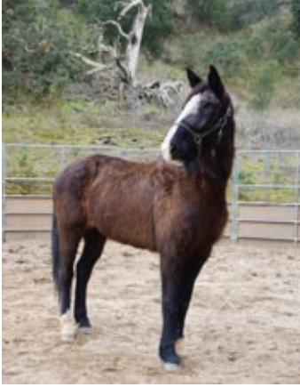
Belle endured so much pain. But your generosity showed her a kindness she'd never known.

Belle came to the SPCA after our humane officers responded to a call about a neglected horse. She was malnourished and frail, with poor hooves, arthritis and untreated Cushing's disease — a progressive condition that causes excessive coat length, weight loss, sweating and laminitis.